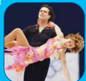
Figure Skating is not only a sport you watch, it is a sport you listen to. Music plays an essential role in the quality of the overall performance of the skaters. When people remember the 1984 Olympic Games and the legendary performance by Jayne Torvill and Christopher Dean, they immediately think of the poignant Ravel's Bolero, the beauty of the skating and the choice of music was just a perfect match. Let's hope there will be other treasures to watch during these Games... and listen to.